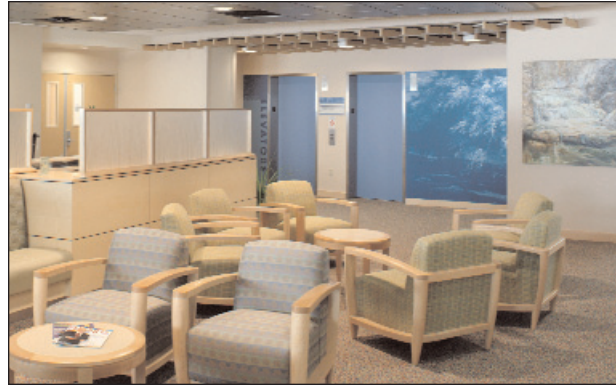
The Mr. and Mrs. Verde V. Dickey Family Waiting Area welcomes patients and families to the Cavanagh Cardiology Center. Below, patients on the road back to a healthy life work out in the new Cardiac Rehab exercise area.

Non-invasive Cardiology - Physicians in the Cavanagh Cardiology Center have a number of tools to help them diagnose the source of heart ailments and the best method of treatment. Tests commonly used to diagnose heart disease include: