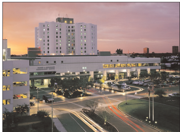
Our practice is affiliated with Banner Good Samaritan medical Center, and our office is located just south of the main hospital.