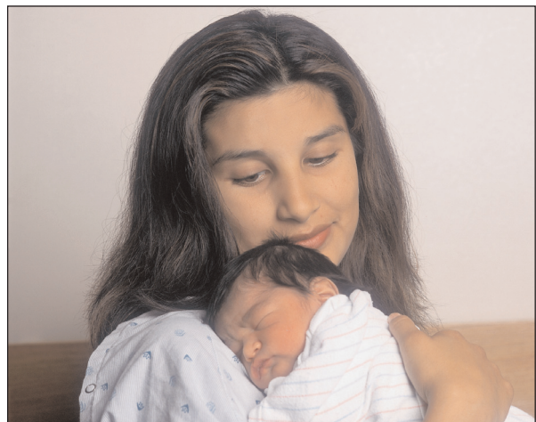
Patients at the Banner Good Samaritan Women's Center benefit from the expertise of the hospital's attending physicians and resident staff.