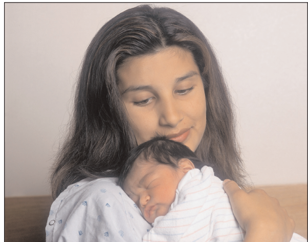
Patients at the Banner Good Samaritan Women's Center benefit from the expertise of the hospital's attending physicians and resident staff.