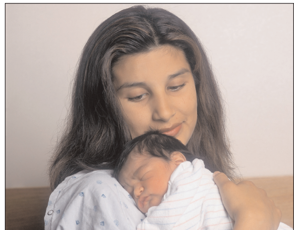
Patients at the Banner Good Samaritan Women's Center benefit from the expertise of the hospital's attending physicians and resident staff.