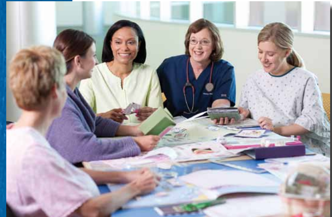
Banner Desert Medical Center staff offer scrapbooking to help high-risk mothers relax.

We recognize excellence is not a singular place; it is series of consistent actions. And we know that providing a superior patient experience is not just one task to be completed; it is an ongoing commitment by us to you.